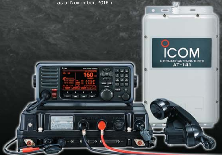
Night mode display

Please Note: The complete GMDSS installation for MF/HF DSC (Class A) and telephony additionally requires the optional antenna tuner, AT-141.